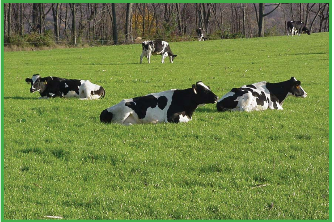
These pastured Holsteins on a Maryland dairy farm average about 19,000 pounds of milk per cow per year.

That is reflected on the bottom line: The net profit on grazing operations Johnson examined from 2002-06 was