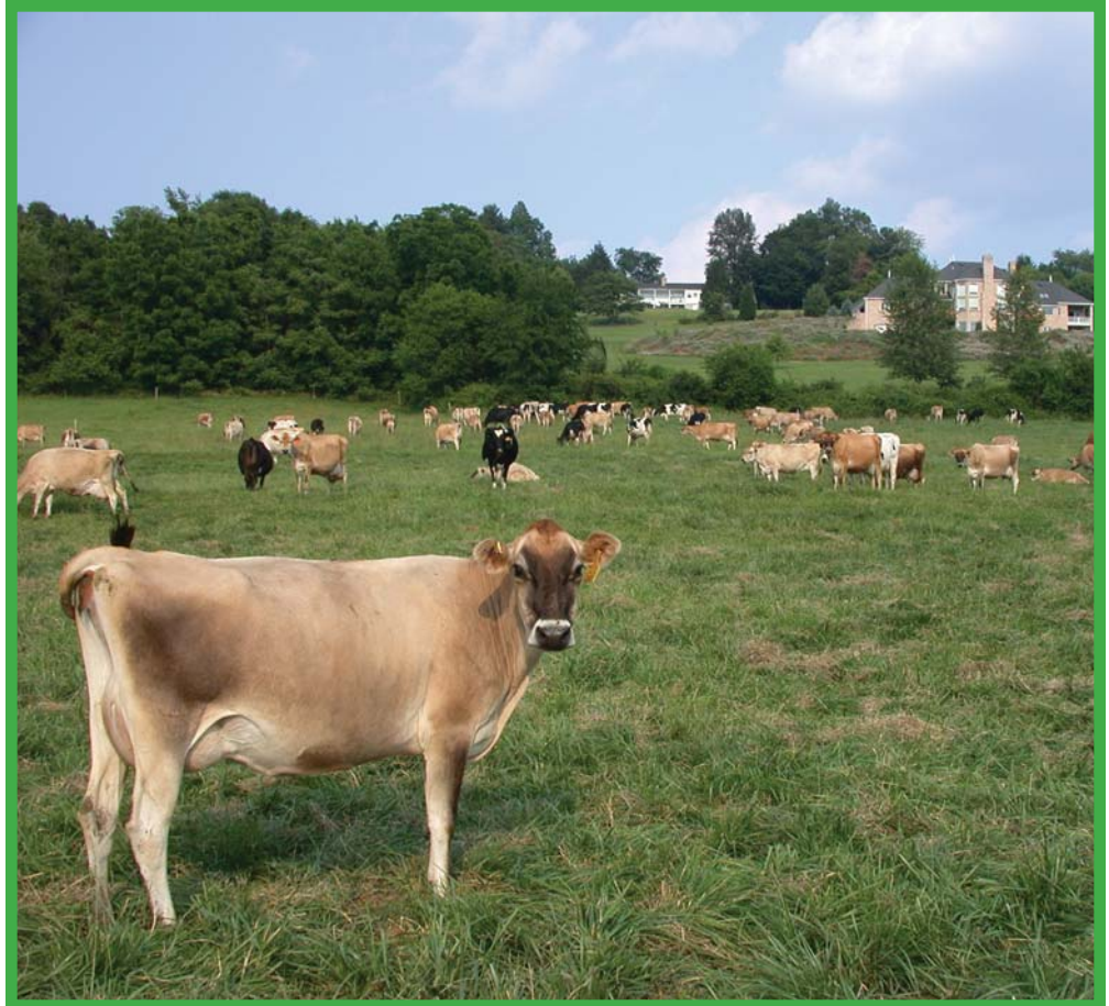
The owner of this dairy herd in Maryland switched to Jersey cows because they convert forage to milk more efficiently. They also are more tolerant of summer heat.