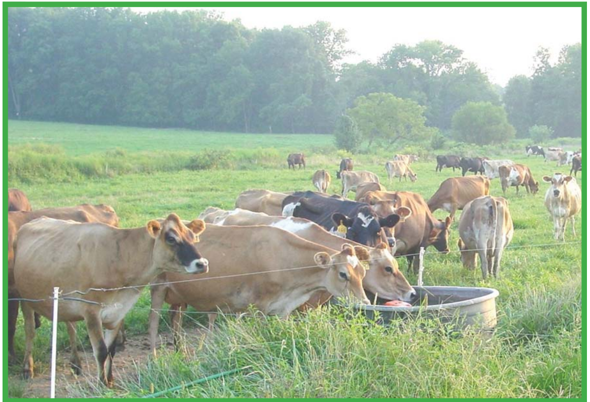
Portable waterers and movable fencing help to keep animals out of the stream as well as manage grass efficiently.

The potential to supply the market with local production is huge. The number of small beef operations is on the rise: In Maryland alone, there are